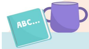
Object and Sensory Cues