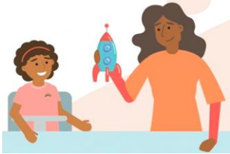
Developing Joint Attention

8 videos with strategies to support your child's communication development: