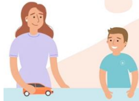
Supporting Language Development Through Play