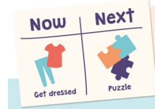
Using a Now and Next Board