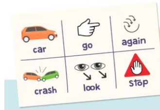
Using a Communication Board