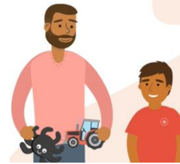
Helping Your Child to Make Choices